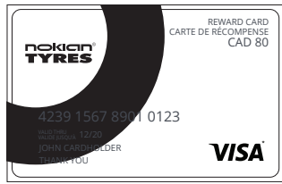
Illustration of the prepaid card as an example only. The received card can be different from that represented here.